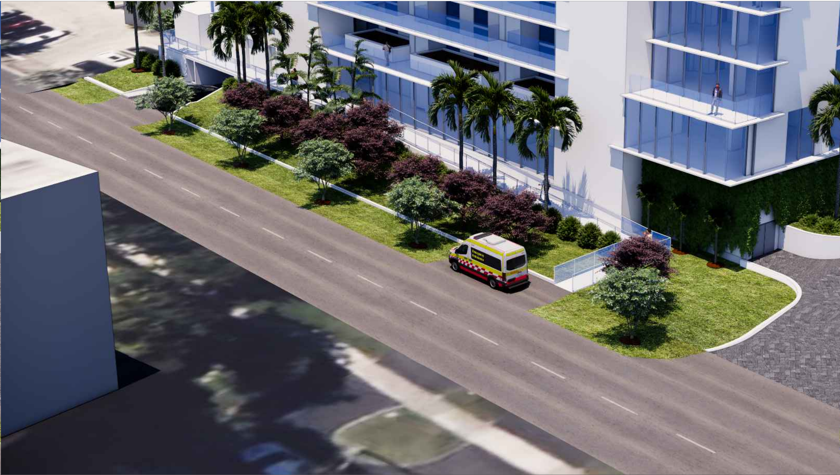
AFTER WITH LANDSCAPING