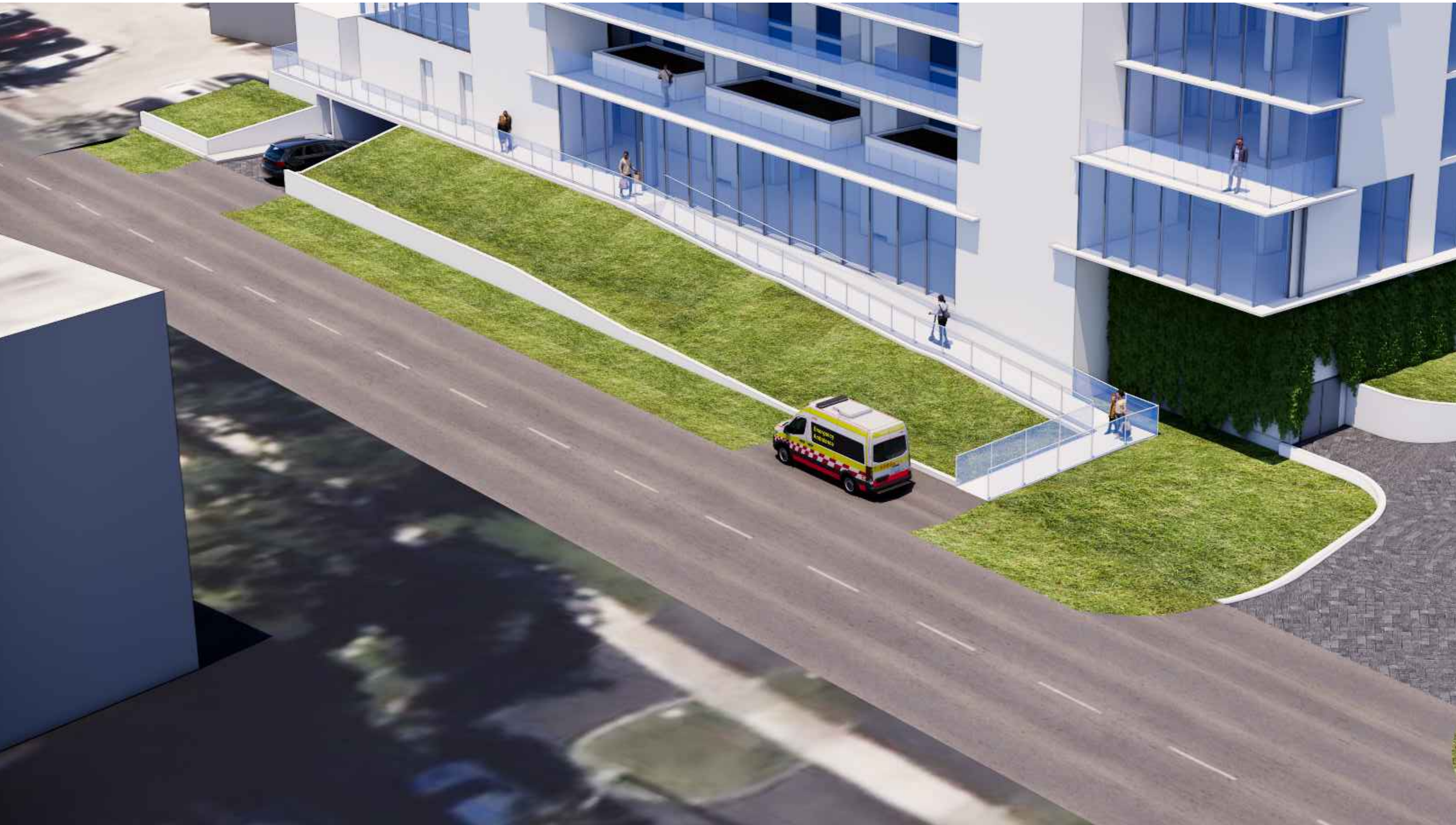
BEFORE WITHOUT LANDSCAPING