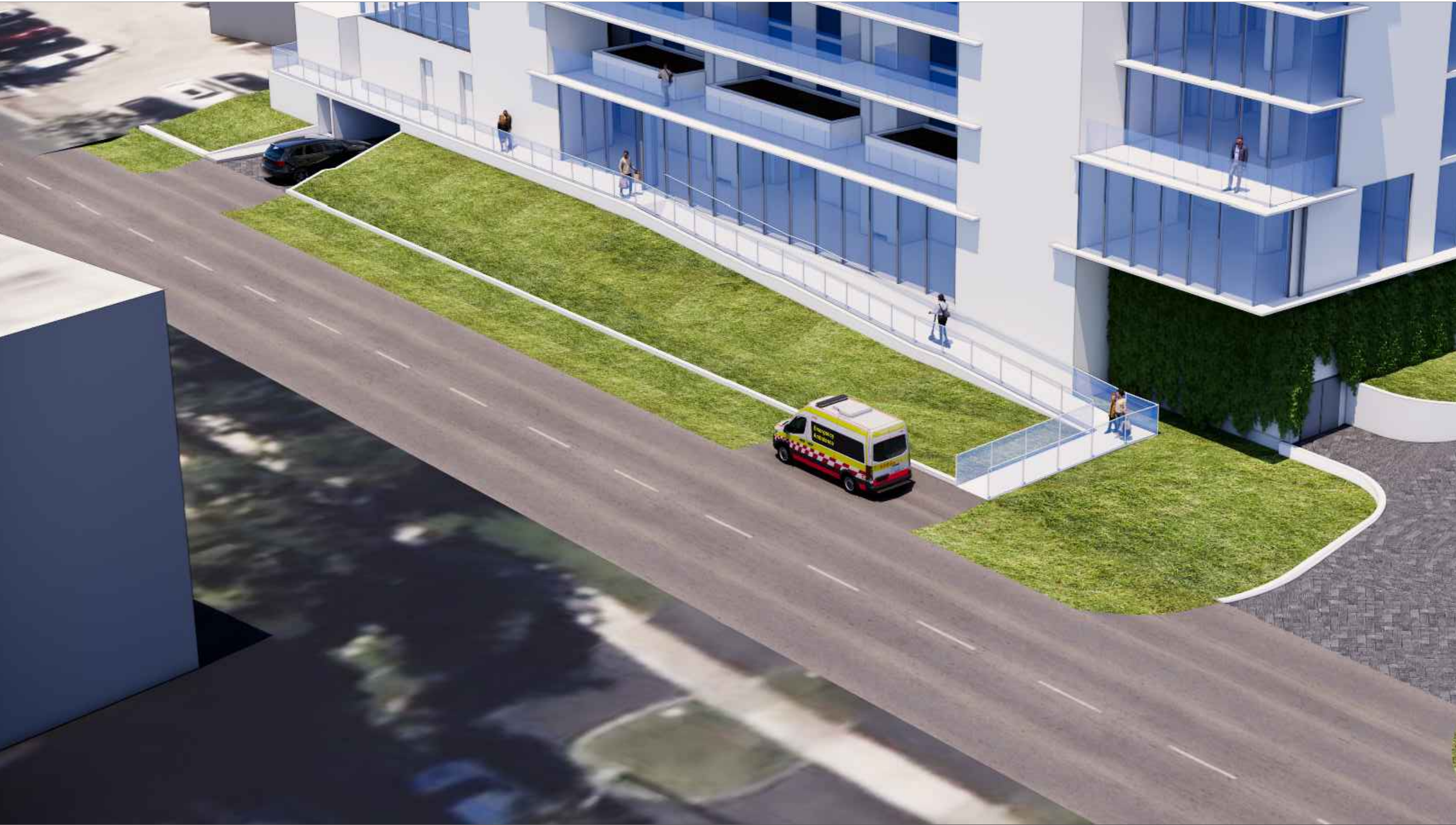
AFTER WITHOUT LANDSCAPING